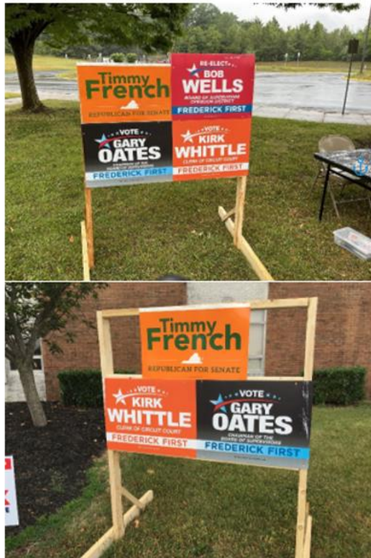
Displayed at SD1 polling locations on Primary Election Day