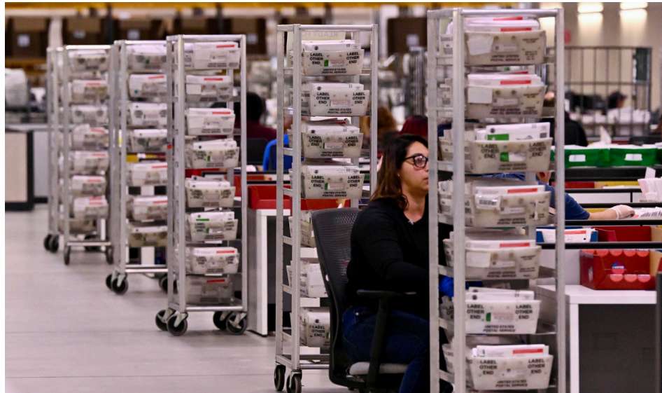
Mail-in ballots wait to be sorted at the Los Angeles County Ballot Processing Center in Los Angeles on Tuesday.

Most Los Angeles City Council incumbents appeared headed for reelection as of Thursday's semi-official results, with several holding comfortable leads well above the threshold needed to avoid November runoffs. The city's two open-seat contests, however, remained unsettled and