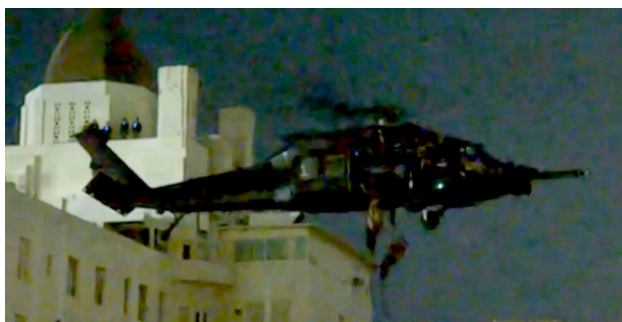
An unidentified branch of the U.S. military conducts a training exercise Wednesday night and Thursday morning at the former St. Luke Medical Center site in Pasadena.

a training exercise late Wednesday in Irvine near Alton Parkway and Irvine Boulevard, city officials said on social media.