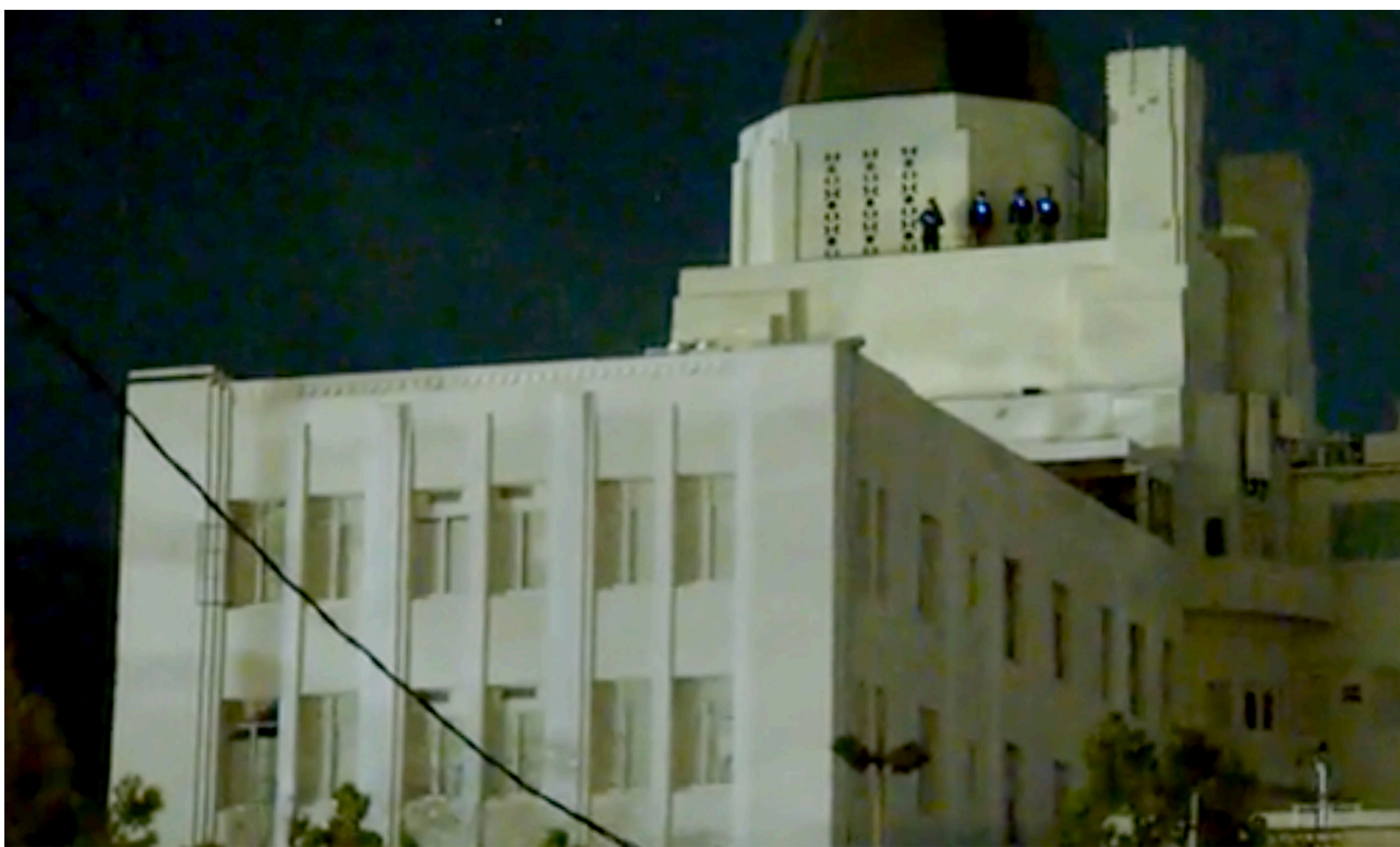
Residents were subjected to sounds of gunfire, flashbangs and low-flying helicopters Wednesday night and Thursday morning, as the military held training moves at the former St. Luke hospital in Pasadena.

Helicopters and gunfire heard in area traumatized a year ago by Eaton fire