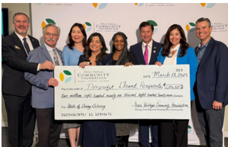
Three Valleys Community Foundation State of Giving

Did you get snapped at an event? Check out the photos below and also our social media to see if you were snapped!