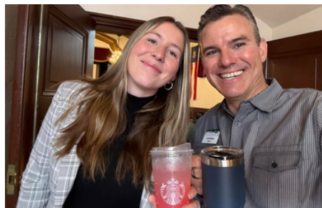
Youth in Government Day