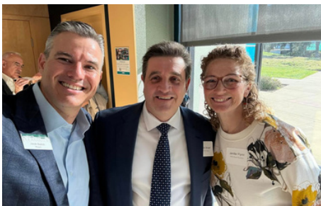
Pleasanton Unified State of the District Event