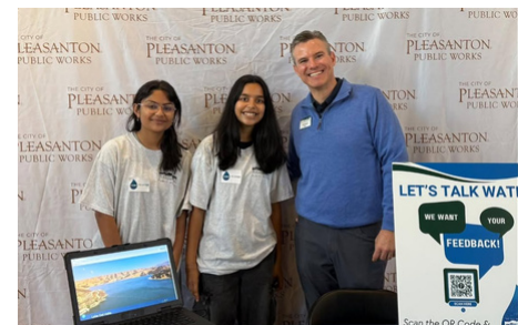
City of Pleasanton Water Open House