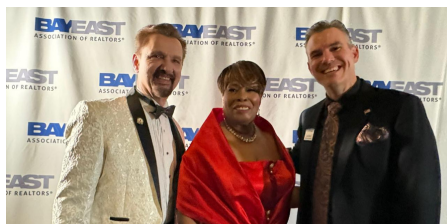
BAY EAST Installation Event