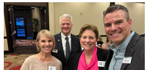
24th MLK Breakfast by Pleasanton Community of Character