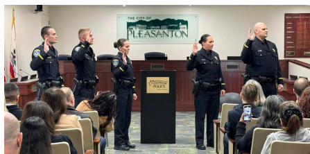
PPD Officer Installation Event