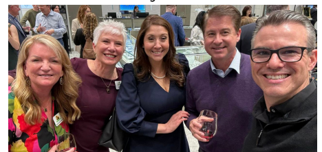
Taste Tri-Valley Opening Night Dinner Celebration