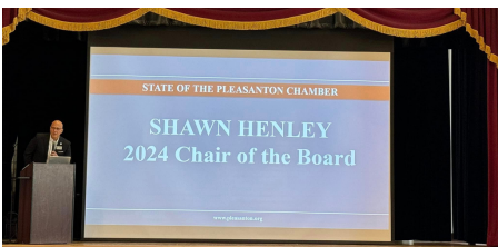
State of the Pleasanton Chamber