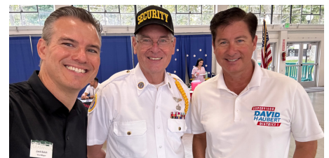
Veterans Stand Down