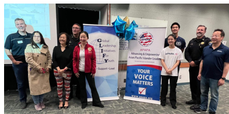
APAPA & GLIFY AAPI Conversation with the Chief Event