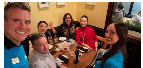
Valley Humane Society's Tips for Change Event