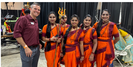
Dussehra Diwali Dhamaka Celebration

Did you get snapped at an event? Check out the photos below and also our social media to see if you were snapped!